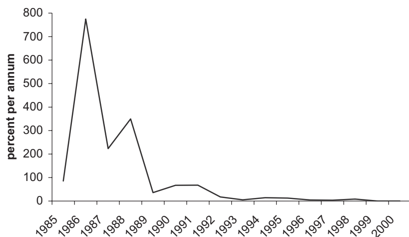
Fig. 1. Inflation 1985–2000 (December to December) Notes: Rate of change of retail price index of goods and consumer services, in per cent. Data before 1991 measure the retail price index of goods, excluding consumer services. Data source: GSO (2000)

A weakening trade balance in 1995–1996 prompted concerns about the overvaluation of the dong and induced to a speculative demand for dollars and eventual depreciation of the dong. This process was reinforced by the Asian crisis in 1997–1998 that curbed the dollar inflow into Vietnam. Despite new administrative measures, such as foreign exchange surrender requirements and import restrictions, the exchange rate came under pressure and depreciated